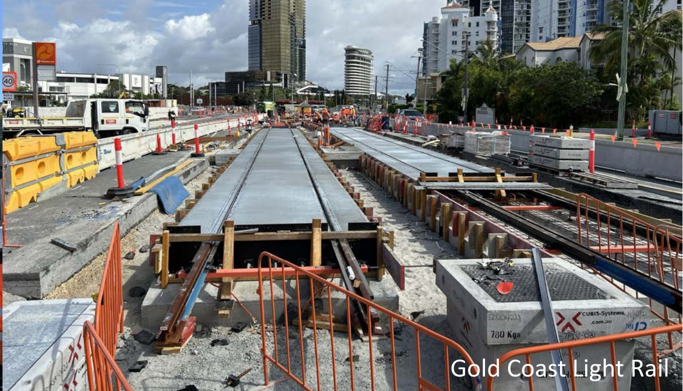
Gold Coast Light Rail