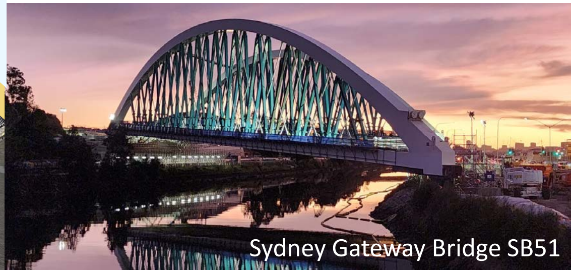
Sydney Gateway Bridge SB51