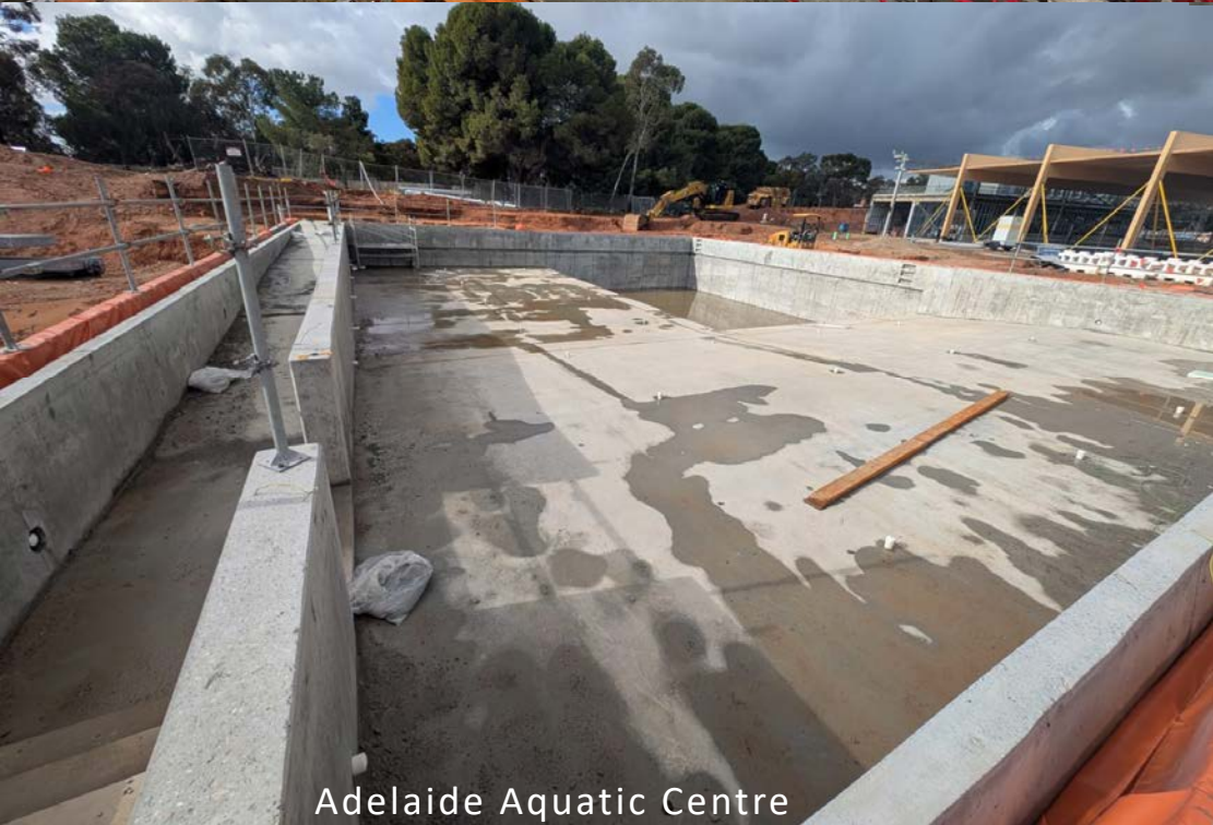
Adelaide Aquatic Centre