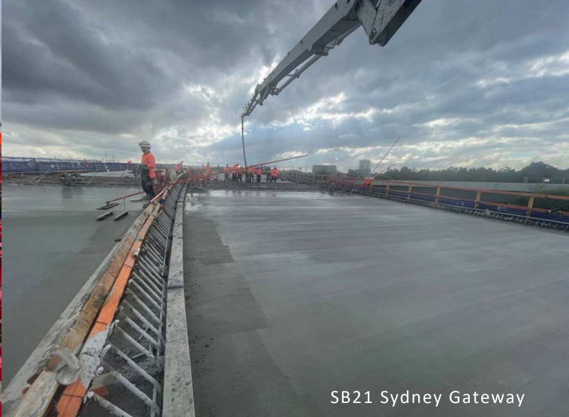
SB21 Sydney Gateway