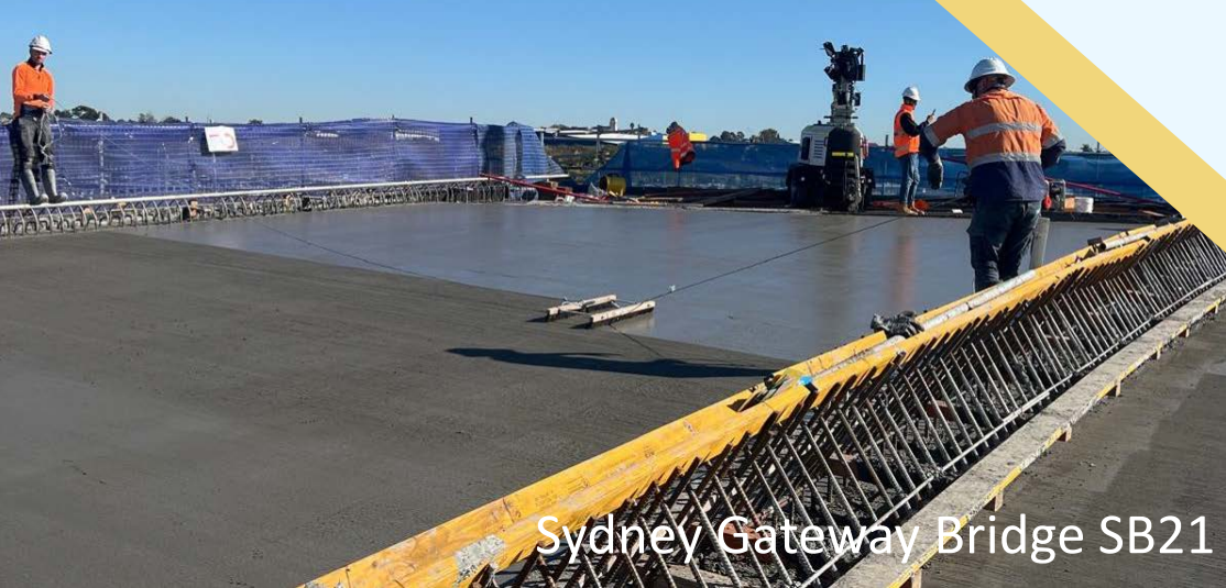
Sydney Gateway Bridge SB21