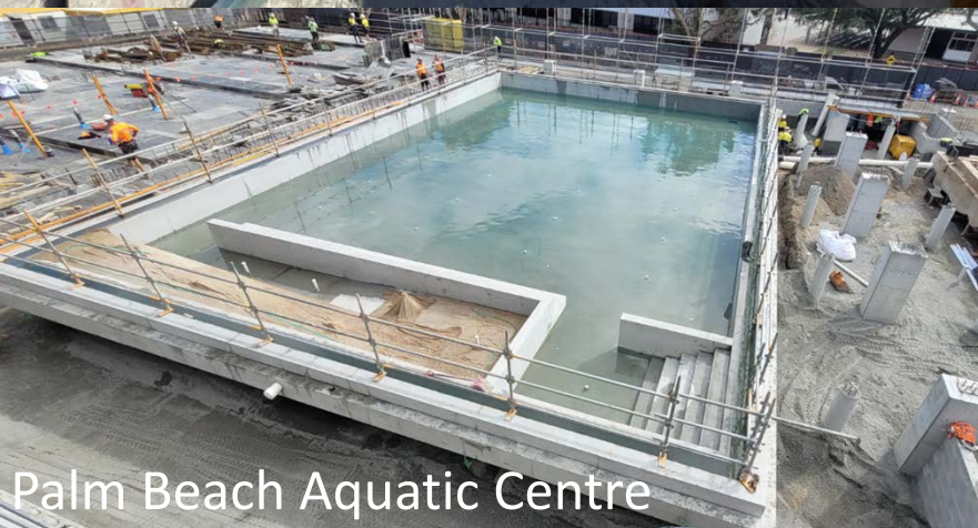
Palm Beach Aquatic Centre