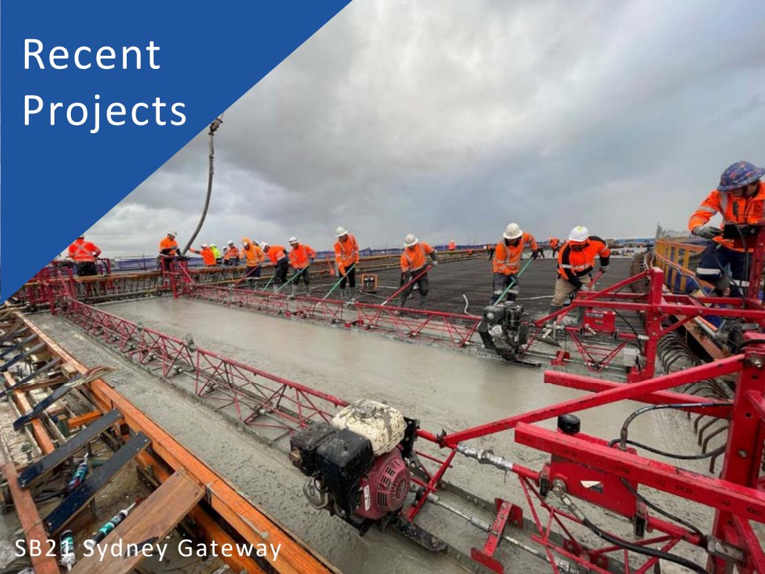
SB21 Sydney Gateway