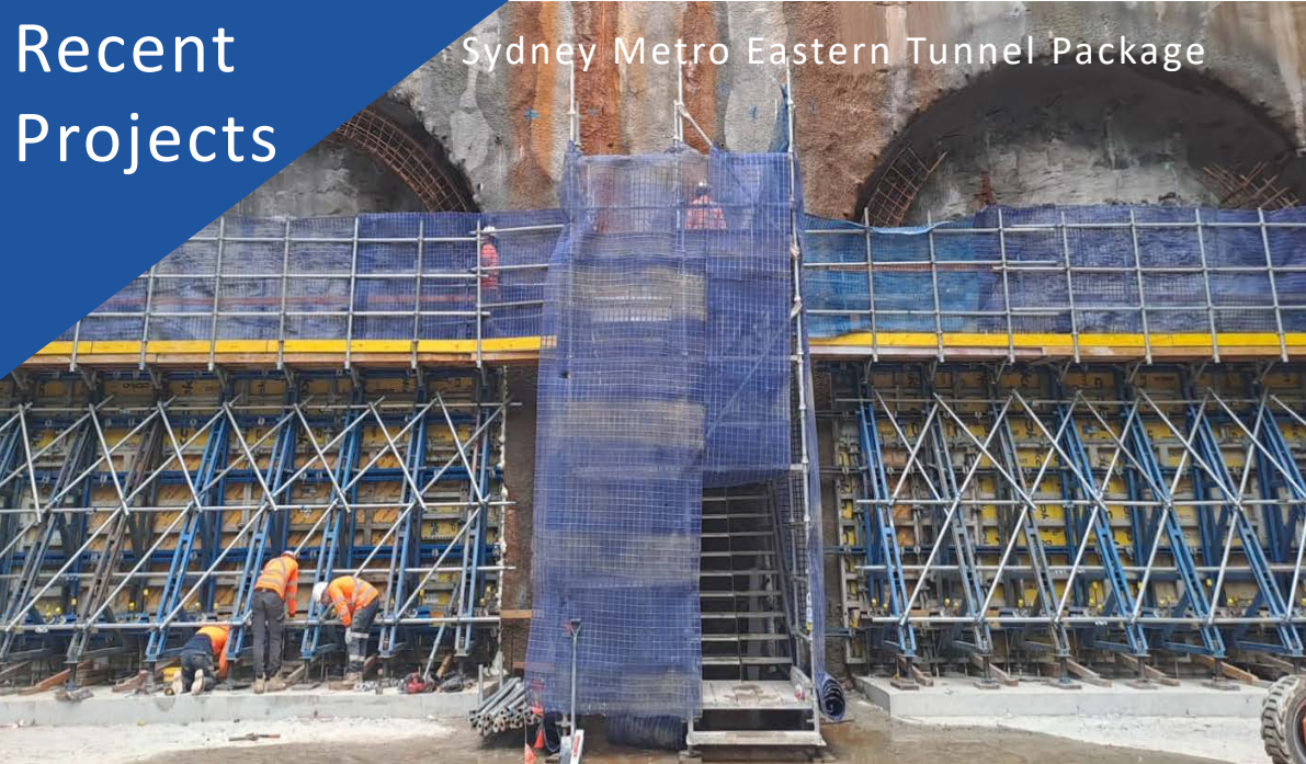
Sydney Metro Eastern Tunnel Package