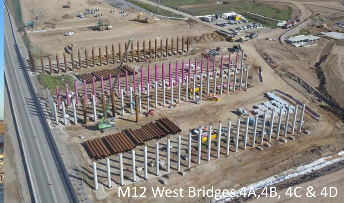
M12 West Bridges 4A, 4B, 4C & 4D