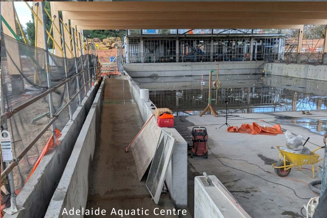
Adelaide Aquatic Centre