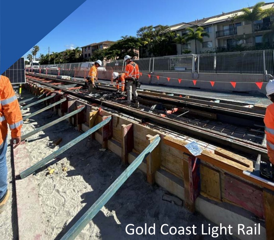
Gold Coast Light Rail